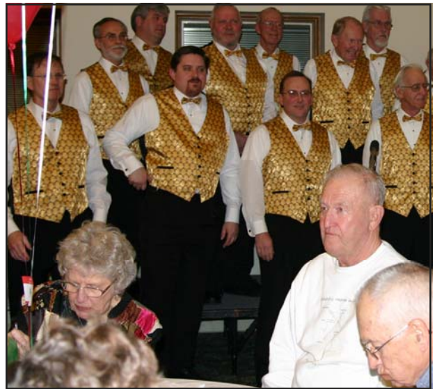
Memories of our "Evening in Italy"

Answers to "Do You Remember?" Question 1: (b) Question 2: (a) Question 3: (c)